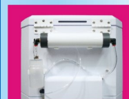
Filter/ Sand Bottle