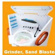
Grinder, Sand Blaster